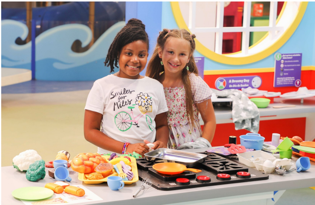
Pictured above: Visitors to the Mississippi Children's Museum—Jackson practice cooking a healthy meal in the "Kareem's Dreamy Day" exhibit funded by the Blue Cross & Blue Shield of Mississippi Foundation.

The Mississippi Children's Museum Opens Kareem's Dreamy Day