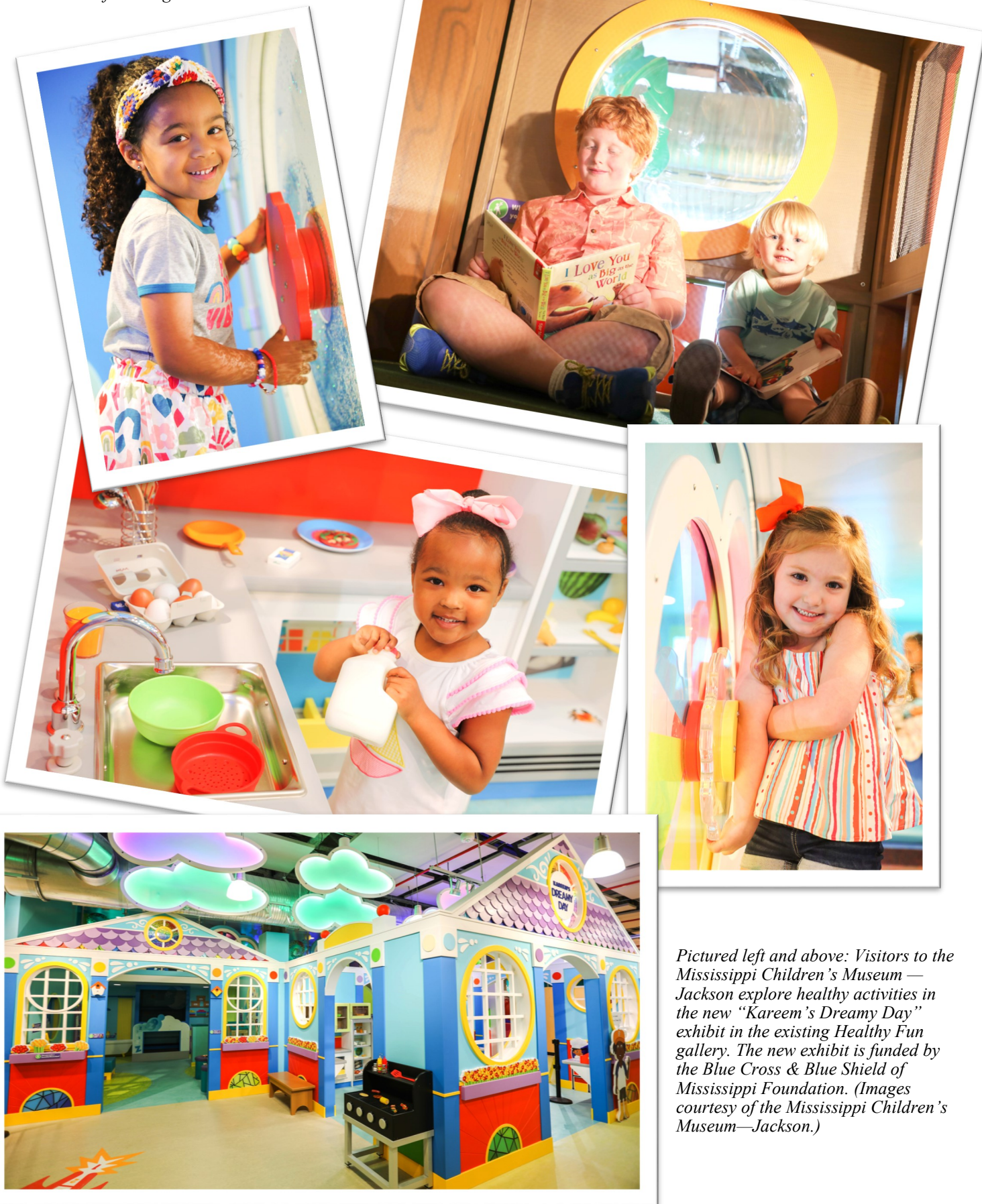
Pictured left and above: Visitors to the Mississippi Children's Museum — Jackson explore healthy activities in the new "Kareem's Dreamy Day" exhibit in the existing Healthy Fun gallery. The new exhibit is funded by the Blue Cross & Blue Shield of Mississippi Foundation.