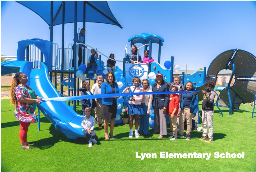
Lyon Elementary School