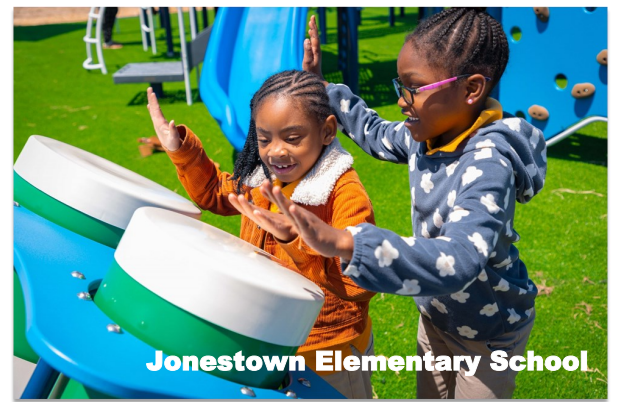
Jonestown Elementary School

The Blue Cross & Blue Shield of Mississippi Foundation recently held ribbon-cutting events for the final three of 11 school playgrounds funded and installed through the Building Healthy Schools | Playgrounds initiative: Lyon Elementary School and Jonestown Elementary School, both in the Coahoma County Public School District, and Houlka Attendance Center in the Chickasaw County Public School District.