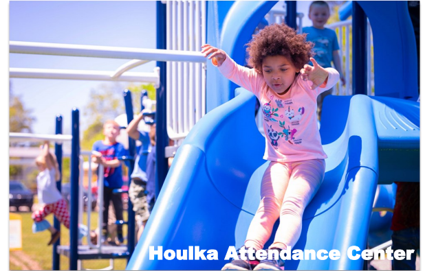
Houlka Attendance Center