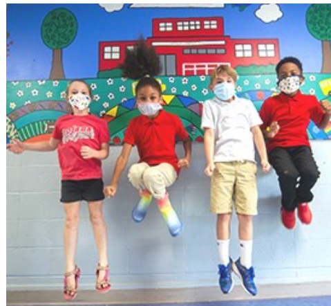
Pictured above: Students at Bell Academy (left) and Northeast Lauderdale Elementary School (right) engage in healthy activities.

Blue Cross & Blue Shield of Mississippi Foundation