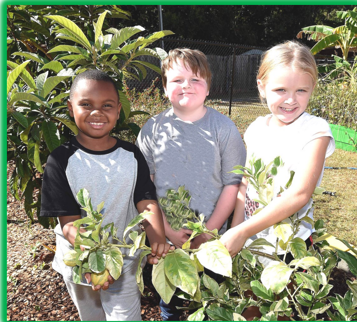
(Pictured above: DeLisle Elementary School students in Gulfport grow lemons to make sugar-free lemonade and add zest to meals.)

“We are appreciative of the added value of a school garden and access to fresh fruits, herbs and vegetables, along with having the outdoor classroom as a resource. New teachers say the garden was one of the reasons they chose to teach at our school.”