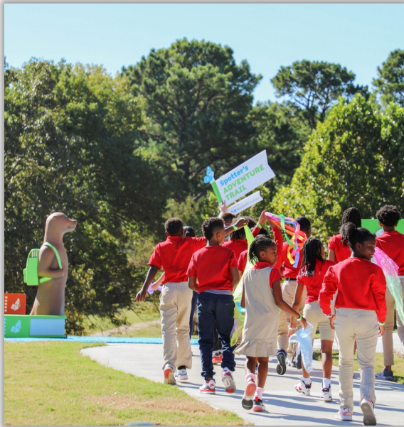
(Pictured above: Students from Spann Elementary School in Jackson take the inaugural walk on “Spotter’s Adventure Trail.”)

Construction is nearing completion on “Spotter’s Adventure Trail” at LeFleur’s Bluff Education and Tourism Complex in Jackson. “Spotter’s Adventure Trail” features an original story of “Spotter the Otter” that is native to the Mississippi Pearl River, a key geographic feature of LeFleur’s Bluff State Park. The Trail provides engaging, family-oriented opportunities to travel between the Mississippi Museum of Natural Science and the Mississippi Children’s Museum, so guests can conveniently visit both museums. The Trail will be fully completed in early 2023, including the installation of all educational activities, play structures, signage, fencing and landscaping.