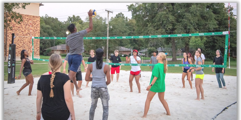
(Pictured Above: Students at Delta State University participate in the “Spike Out the Smoke” intramural volleyball tournament on the new sand volleyball court provided by Foundation grant funds.)

DSU used part of the $50,000 grant award to build a sand volleyball court located between residence halls and open to all community members. In the spirit of a tobacco-free campus, the university hosted the first annual “ Spike Out the Smoke ” intramural volleyball tournament at the beginning of the 2022 academic year to encourage physical activity and bring awareness to the benefits of living tobacco-free.