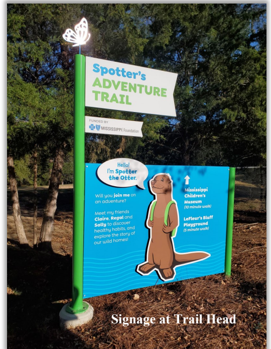
Signage at Trail Head

increase. The Playground, Outdoor Classroom and Pavilion and Museum Trail were funded by a generous grant from the Blue Cross & Blue Shield of Mississippi Foundation.