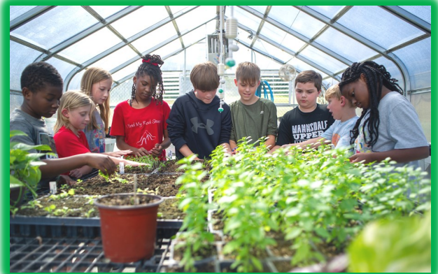
(Pictured above: Students at Mannsdale Upper Elementary School in Madison County harvest sweet potatoes in the garden and tend to plants in the greenhouse in preparation to sell produce at the local farmers' market. Market sales are part of the school's ongoing sustainability plan for the garden.)