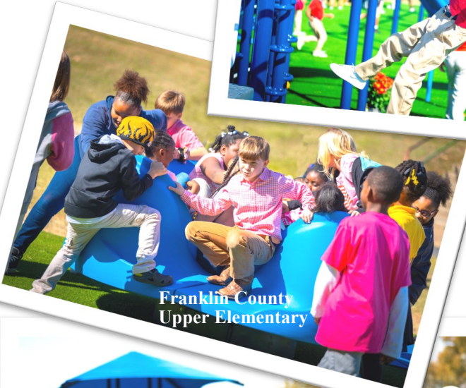
Franklin County Upper Elementary